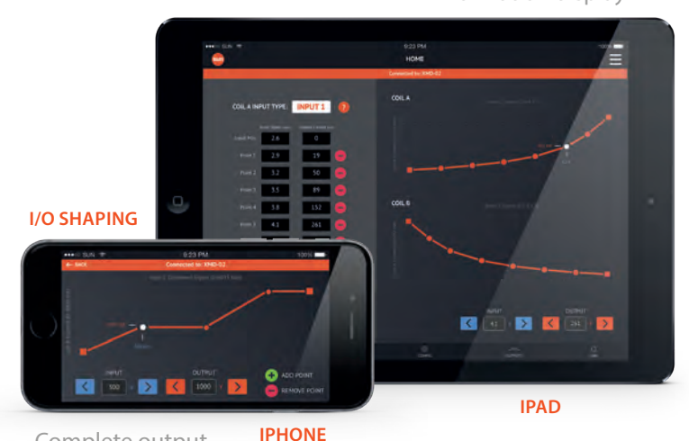
Complete output configurability

iPad version offers expanded information display