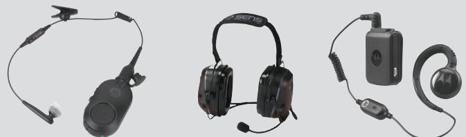
NNTN8294 (Wireless Pod not included)

Wireless accessories give you the flexibility to remove the radio from your belt and stay connected within 30 feet. We've embedded Bluetooth in to your XPR 7000 Series radio so no adapter is needed. A full portfolio of wireless accessories are available to meet your specific business needs. The XBT Heavy-Duty Wireless Headset is the state-of-the-art digital headset that unleashes the power of MOTOTRBO radios to shield you from harmful, high-decibel noise while letting you hear the sounds you need to – people, alarms, alerts and more.