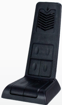
Optional: DM350HD Desktop Microphone