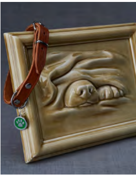
DOG PORTRAIT DARK SAND