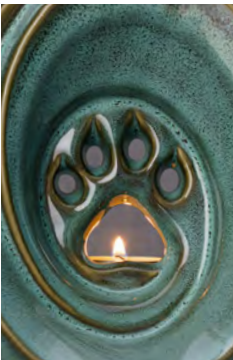
OILY GREEN MELANGE