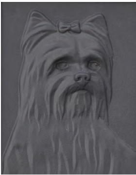
YORKIE GREY MATTE