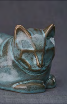
OILY GREEN MELANGE