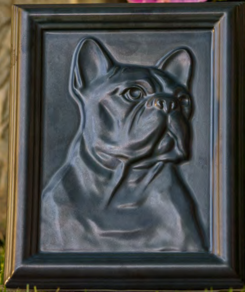
FRENCHIE Dark matte FREN-07