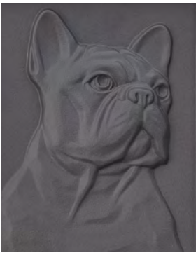
FRENCH BULLDOG GREY MATTE

FOR MORE COLOR OPTIONS, PLEASE REFER TO OUR WEBSITE: PULVISURNS.COM