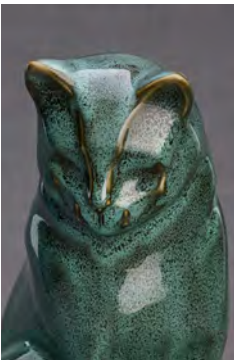
OILY GREEN MELANGE