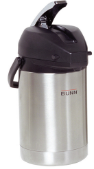
AIRPOT, 2.5L SST LA SINGLE PK