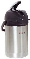
AIRPOT, 2.5L SST LA 6/ CASE