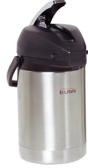
AIRPOT, 2.2L SST LA SINGLE PK