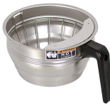
FUNNEL ASSY,SST-BLK HDL(7.62