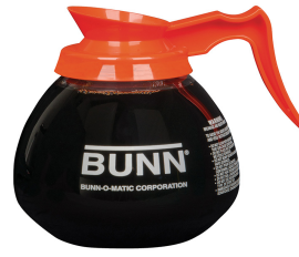
DECANTER, GLASS-ORN 12 CUP 1PK