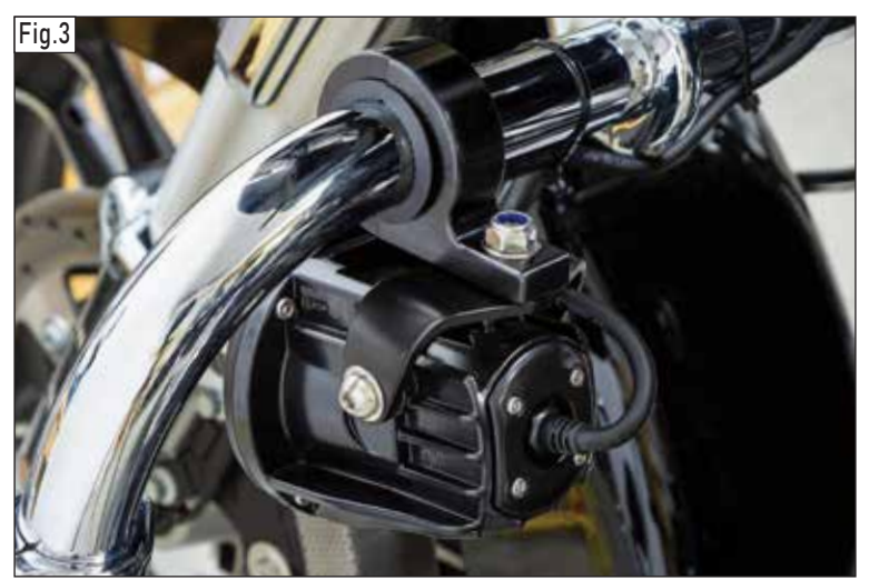
G0045019, REV. - For the latest version of installation instructions visit www.ciro3d.com