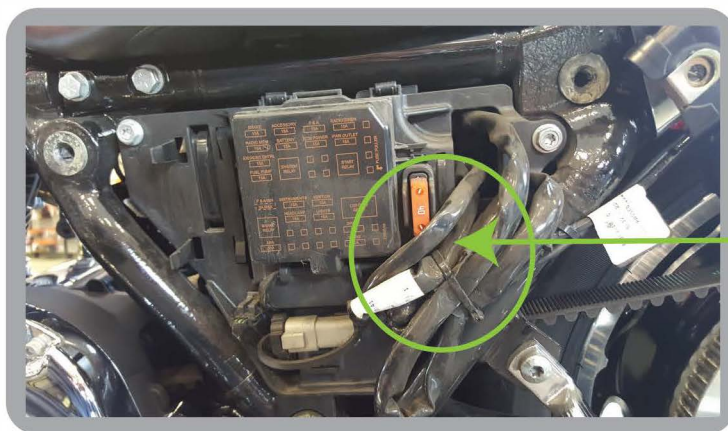
6 pin connector behind wires

7. Locate the 6 pin rear tail light harness connector under the left hand side cover. Disconnect it. Place a small amount of dielectric grease on all connectors, then plug the supplied wiring adapter in line with the 6 pin connector. Route the brown wire to the right side of your motorcycle and leave the violet wire on the left side.