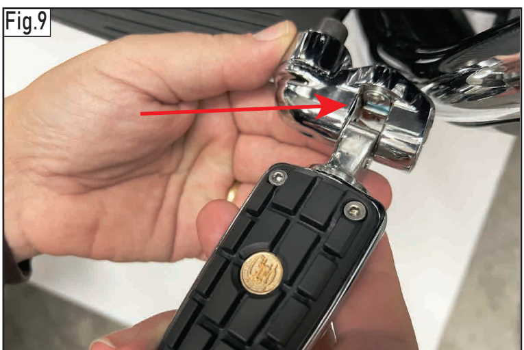
G0066200, REV.- For the latest version of installation instructions visit www.ciro3d.com