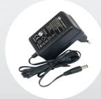
24V 0.8A Adapter