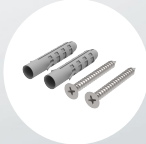
Mounting kit (K-33)