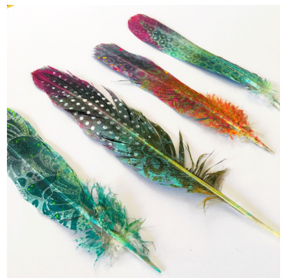
Feather Printing with Birgit Koopsen