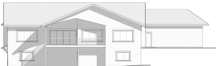
REAR ELEVATION SHOWN WITH WALKOUT LOWER LEVEL