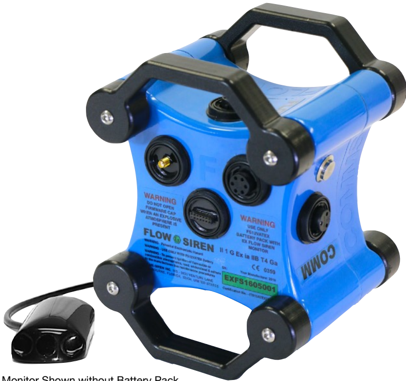
* Monitor Shown without Battery Pack