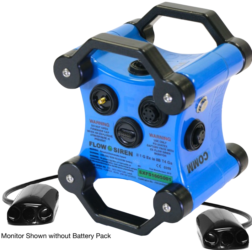
* Monitor Shown without Battery Pack