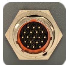
Standardized Camera Port on Every ECOSiren® Monitor

Each ECOSiren® monitor has a standardized camera port allowing you to monitor with vision® at any time. Great for overflow verification, industrial trade waste color, and Infiltration detection. Camera resolution can range from 5MP all the way down to 0.1MP, complete with user programmable compression.