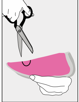
5. Fold the skin protection plate in 2, and cut around the marked area.