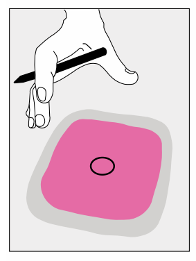
4. Remove the skin plate, after the hole is marked. Find a scissor