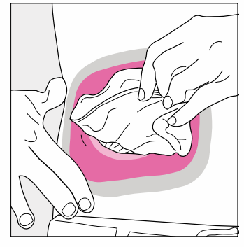
5. Smooth over the Stoma Pad and check that there are no opening on the sides.