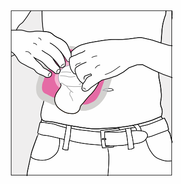
2. Hold the Stoma Pad with the adhesive side aginst the skin, then pull the bag through the hole.