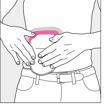
3. When the bag is through the hole, reduce uneveness by smoothing the skin plate on the skin.