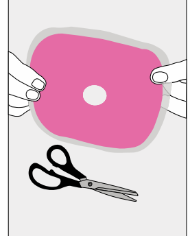
6. The skin protection plate is ready to be placed on the