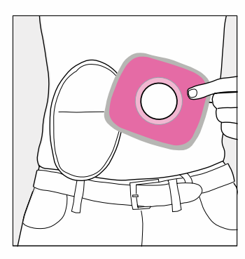
1. Put on the ostomy bag as usual. Remove the Stoma Pad out of the package.