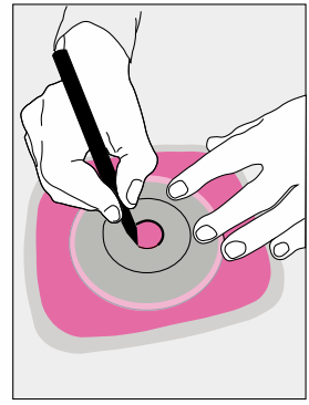
3. Draw a mark of the hole for your stoma

«The litterature describes that up to 80% of all people with a stoma experience peristomal skin complications, most of which are related to a poor seal around the pouch».