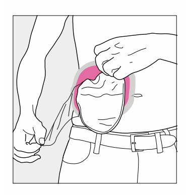
4. Remove one of the adhesive protectors and attach the Stoma Pad on the skin. Repeat on the other side.