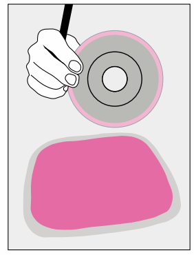
1. Take out a pre-cut skin plate that has been adapted to your stoma.

Cut the hole slightly larger than the stoma so that the bandage does not get in touch with the stoma.