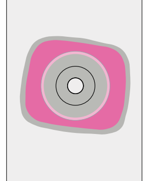
Place the skin plate over the Erland Care Protective Skin