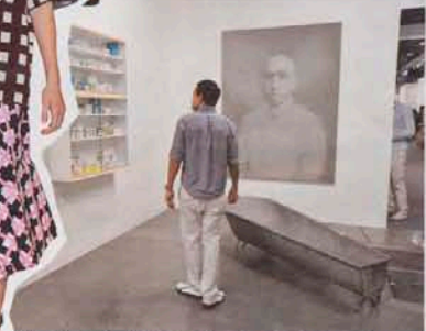
Works by Damien Hirst, Zhang Huan, Tracey Emin at White Cube gallery, London, at Art Basel