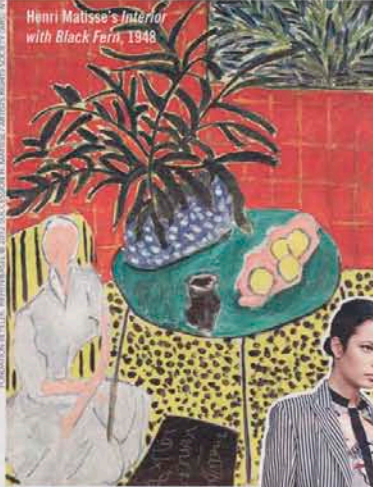
Henri Matisse's Interior with Black Fern , 1948