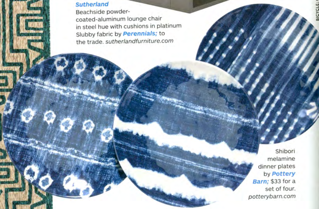
Shibori melamine dinner plates by Pottery Barn ; $33 for a set of four. potterybarn.com

BICYCLE: COURTESY OF MARTONE CYCLING CO.; CHAIR: