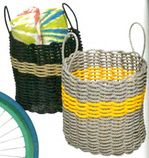
The Rope Co. 16"-tall rope bins ($77 each), and John Robshaw Textiles cotton beach towels ($40 each) in Imrita (left) and Fergana styles. theropeco.com and johnrobshaw.com