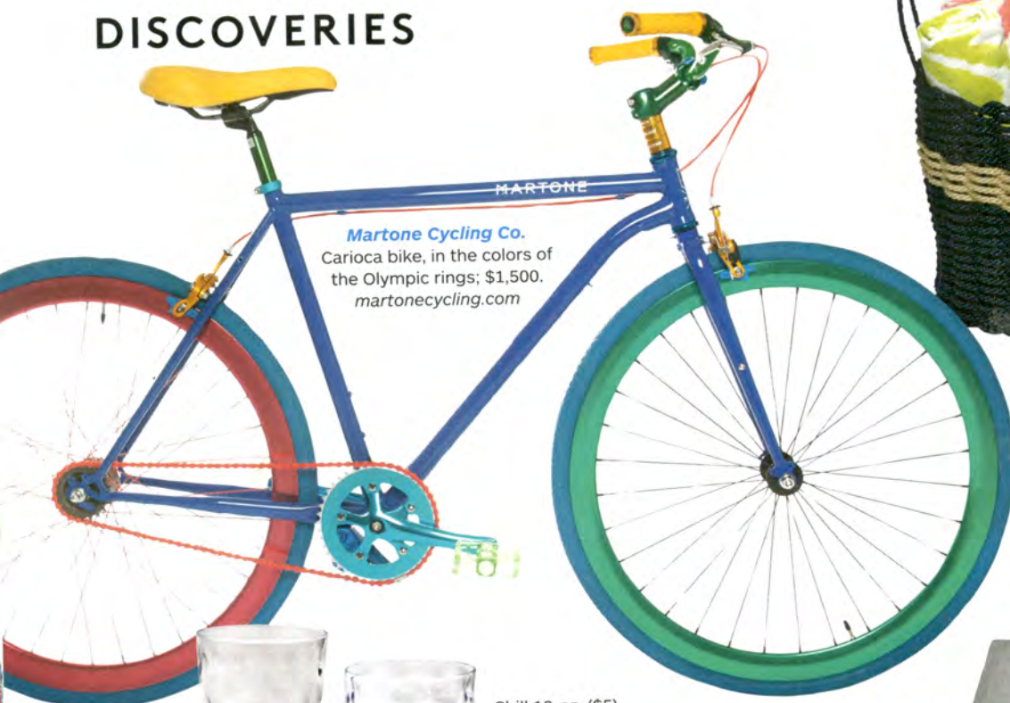
Martone Cycling Co. Carioca bike, in the colors of the Olympic rings; $1,500. martonecycling.com