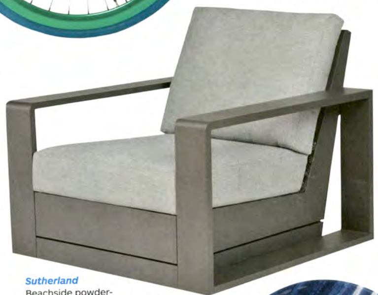
Sutherland Beachside powder- coated-aluminum lounge chair in steel hue with cushions in platinum Slubby fabric by Perennials ; to the trade. sutherlandfurniture.com