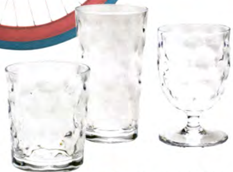
Chill 18-oz. ($5) and 24-oz. ($6) acrylic tumblers and wineglass ($6) by Crate and Barrel . crateandbarrel.com