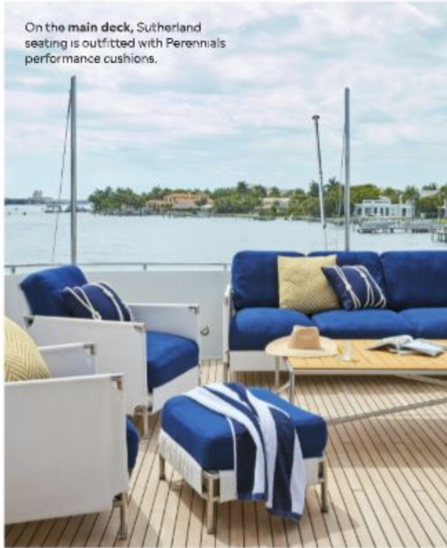
On the main deck, Sutherland seating is outfitted with Perennials performance cushions.