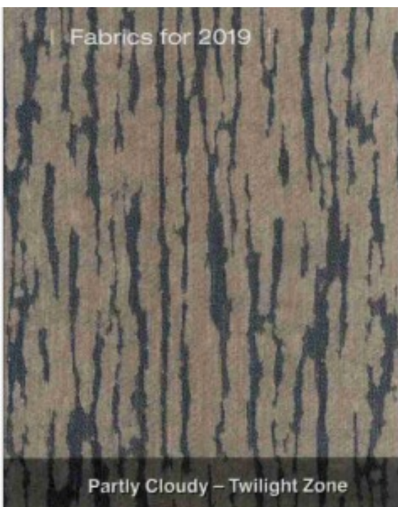
Partly Cloudy – Twilight Zone