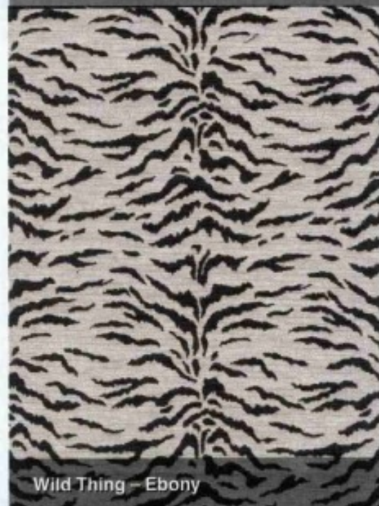
Wild Thing – Ebony