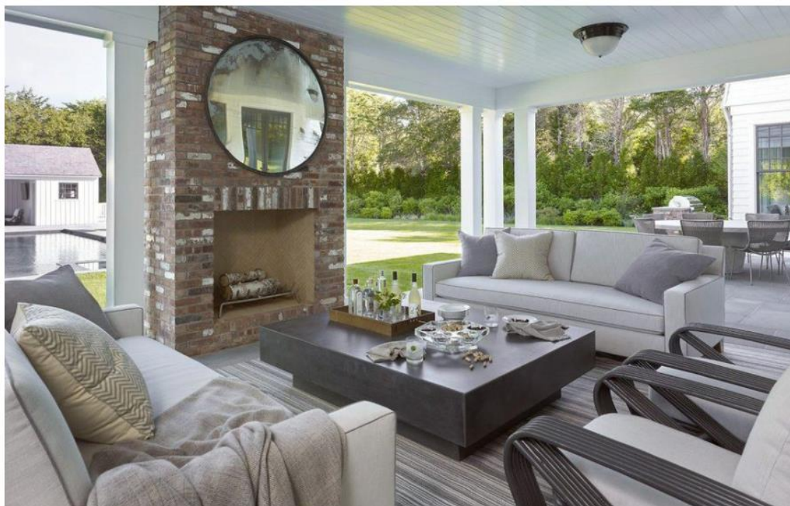
A Sophisticated Beach House by Dan Scotti

The rear facade of the house; the umbrellas and chaises are by David Sutherland, and the cushions are upholstered in Perennials fabrics.