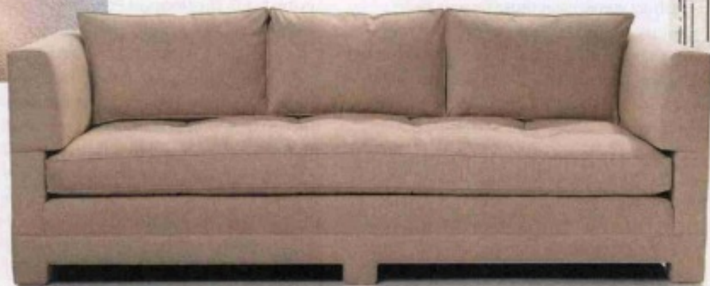
O'Henry House 1050 Sofa Studio 534, BDC suite 534, ohenryhousetld.com