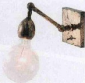
The Egg Wall Light Webster & Company, BDC suite 242, rosetarlow.com