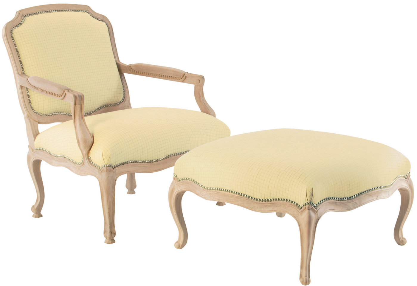
21004 Louis Soleil Lounge Chair, 21003 Louis Soleil Lounge Ottoman