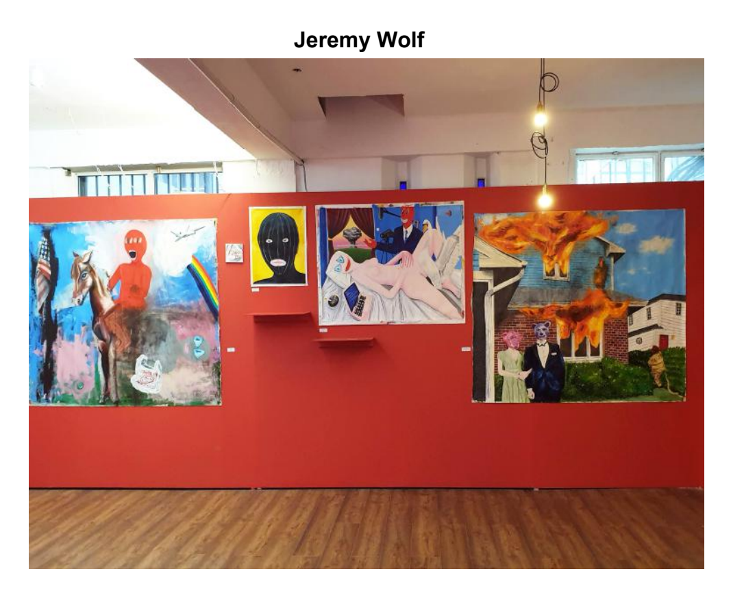
"Paintings that react to the seismic shifts in the current American political landscape"

"Themes of identity, power dynamics, and relationships"