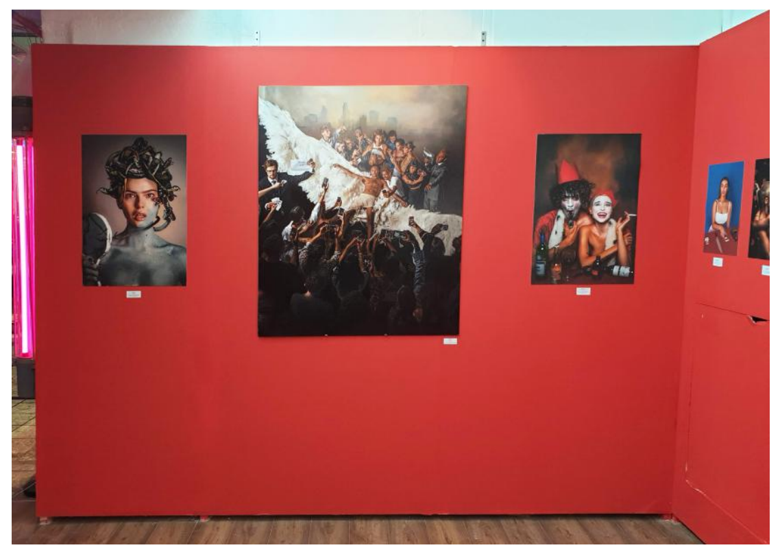
"Draws upon a history of romanticised and allegorical imagery which he reworks to push often uncomfortable issues, into a contemporary dialogue"