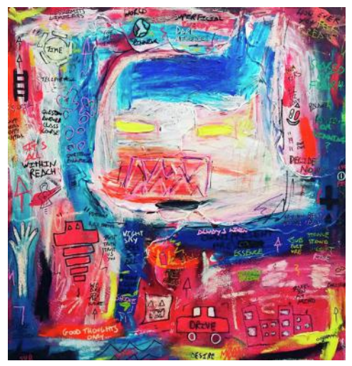
Shem Demon in my mind Miixed media on canvas 80cm x 80cm

"extraordinary visual and critical vocabulary"