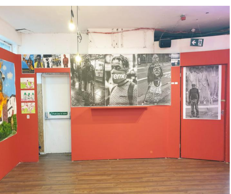
"uses his lens to document all members of society in attempt to normalise marginalised groups