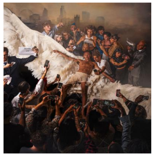
Seb Xavier Icarus Fine art print on Epsom semi gloss paper 102 x 127cm