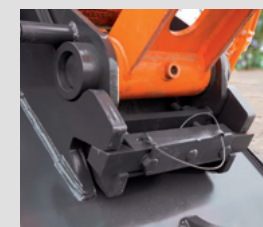
Wedge Lock Quick Coupler