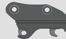
Hydraulic "Pin Grabber" Quick Coupler