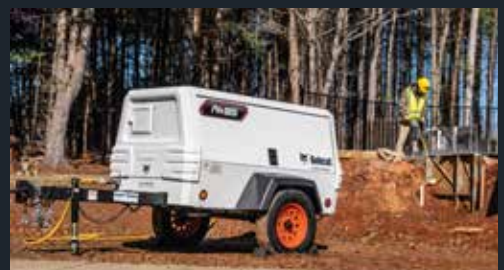
PORTABLE AIR COMPRESSORS

Without costly downtime, imagine how much you'll accomplish. Whether you're building a bridge or building, responding to a natural disaster, or producing an outdoor event, our lineup of portable generators, light towers and portable air compressors keeps running until the job is finished - no matter the conditions.