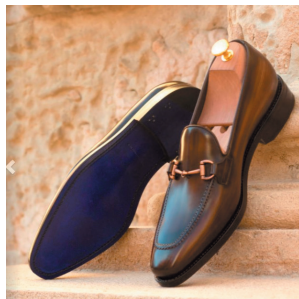
LIGHT BROWN LEATHER LOAFER