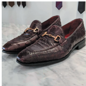
OSTRICH BURGUNDY LOAFER