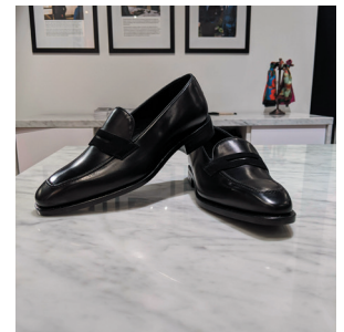
BLACK LEATHER LOAFER