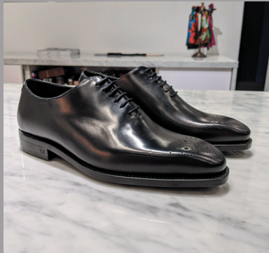
BLACK WHOLECUT SHOE

Sharing the day with your family and friends is one of the best bonding moments you can share. Walk together as a team everywhere you go. Have a piece of memorabilia so everyone can remember the day! Put your nicknames on the shoes or add a personal touch for each. Bundle pricing available.