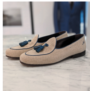
TAN SUEDE LOAFER