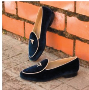
NAVY VELVET LOAFER