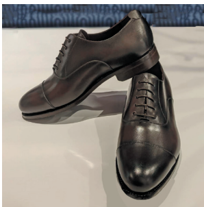
DARK BROWN LEATHER SHOE