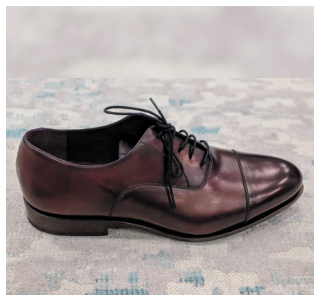
BURGUNDY LEATHER SHOE