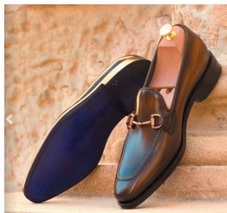
LIGHT BROWN LEATHER LOAFER