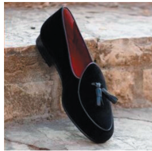
BLACK VELVET LOAFER