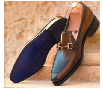
LIGHT BROWN LEATHER LOAFER