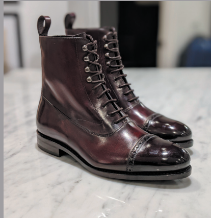
BURGUNDY LACE UP