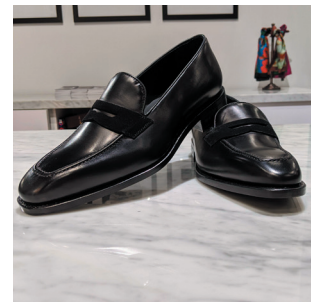
BLACK LEATHER LOAFER