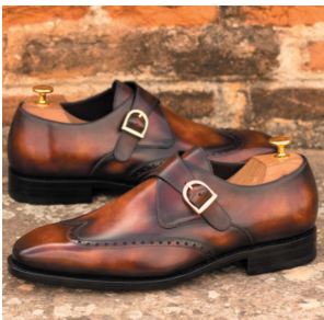
COGNAC LEATHER SHOE