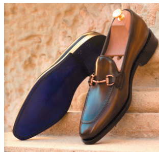
LIGHT BROWN LEATHER LOAFER