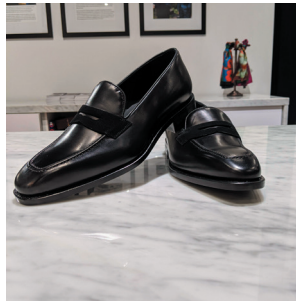
BLACK LEATHER LOAFER