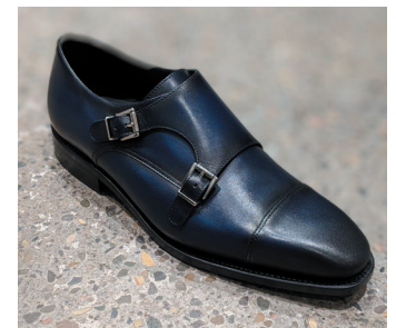
NAVY DOUBLE MONK SHOE