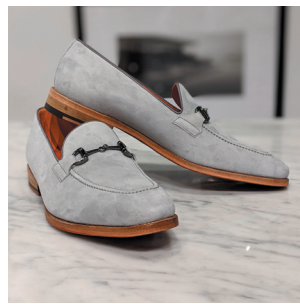
GREY SUEDE LOAFER