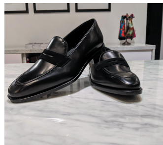
BLACK LEATHER LOAFER