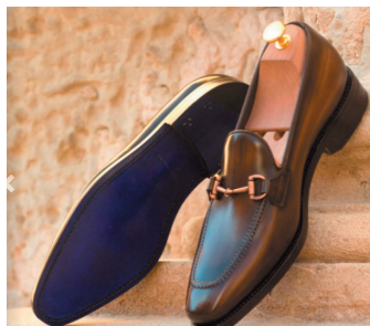
BROWN LEATHER LOAFER