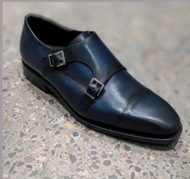
NAVY DOUBLE MONK SHOE