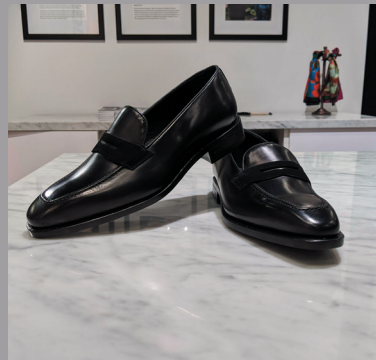
BLACKT LEATHER LOAFER