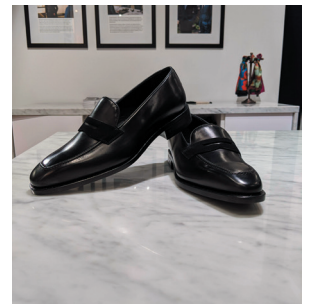
BLACK LEATHER LOAFER