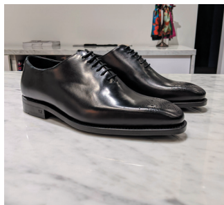
BLACK WHOLECUT SHOE