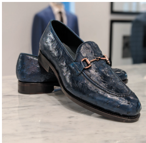
NAVY OSTRICH LOAFER