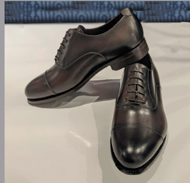
DARK BROWN SHOE