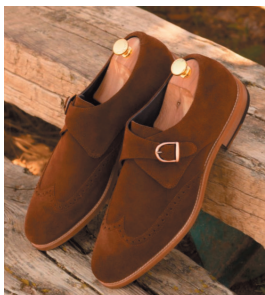
BROWN LEATHER SHOE