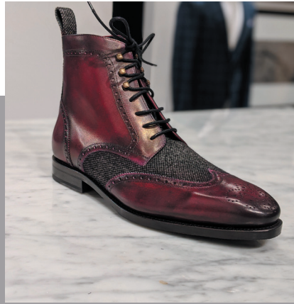
JAM RED DEFENDER