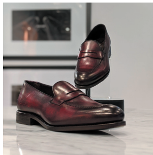
BURGUNDY LEATHER LOAFER