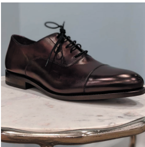
BURGUNDY LEATHER SHOE