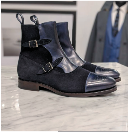
NAVY DOUBLE MONKSTRAP