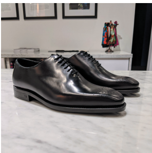
BLACK WHOLECUT SHOE