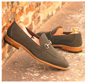
KHAKI SUEDE LOAFER