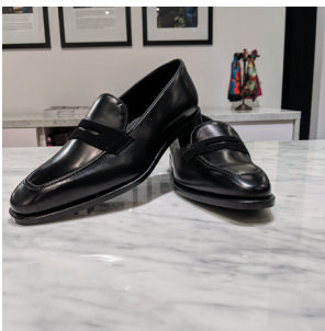
BLACK LEATHER LOAFER