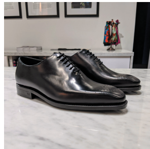
BLACK WHOLECUT SHOE