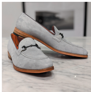
GREY SUEDE LOAFER