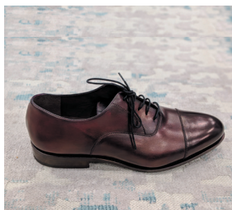
BURGUNDY LEATHER SHOE