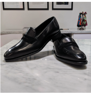
BLACK LEATHER LOAFER