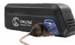
Model: EMZ30 Size: 185 x 65 x 65 mm (7.28*2.56*2.56in L*W*H)