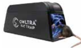
Model: ERZ20 Size: 246 x 87 x 103 mm (9.69*3.43*4.05in L*W*H)