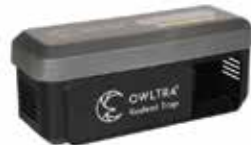
Model: ERZ-50 Size: 287*104*117 mm (11.3*4.09*4.6 in L*W*H)