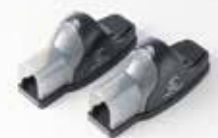
Model: TST-217 Size: 155 x 59 x 73 mm (6.1*2.32*2.87in L*W*H)