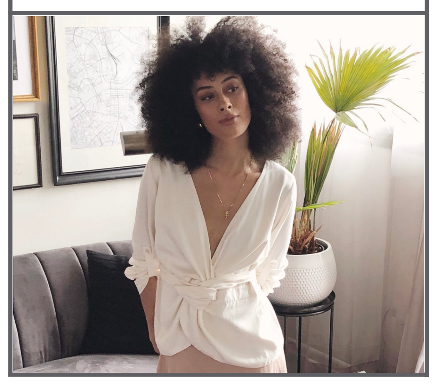
SIMPLE - FLEXIBLE - CONSCIOUS APPROACH - 1 BAG