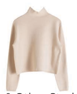
& Other Stories Cropped Relaxed Fit Turtleneck