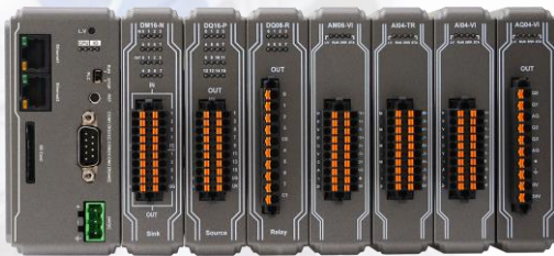
(I/O modules not included)