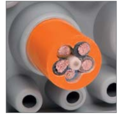
Conical shape on back provides additional sealing and strain relief