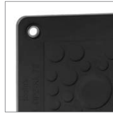
KEL-DPZ also available in black.