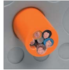
Membrane on front