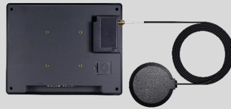
Demo for use with HMI (HMI needs to be purchased separately)