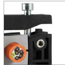
KEL-U 24 on request also available with threaded bushings.