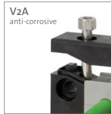
KEL-U 24 also available with V2A screws.

Click to shop online @ www.trimantec.com or call 336-767-1379