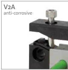
V2A anti-corrosive KEL-ER also available with V2A screws.

Click to shop online @ www.trimantec.com or call 336-767-1379