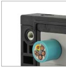
KEL-ER on request also available with threaded bushings.