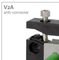
KEL-ER also available with V2A screws.

Click to shop online @ www.trimantec.com or call 336-767-1379