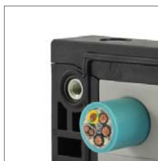
KEL-ER on request also available with threaded bushings.