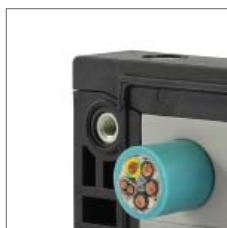
KEL-ER on request also available with threaded bushings.