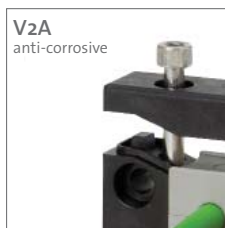
KEL-ER also available with V2A screws.

Click to shop online @ www.trimantec.com or call 336-767-1379