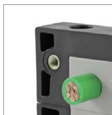
KEL 16 on request also available with threaded bushings.