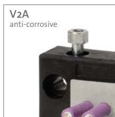
KEL 16 also available with V2A screws.