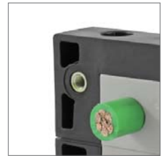
KEL 10 on request also available with threaded bushings.