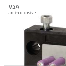
KEL 10 also available with V2A screws.