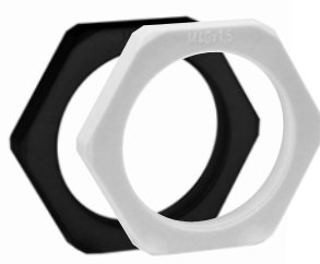
Type KGM: Standard nut, plastic