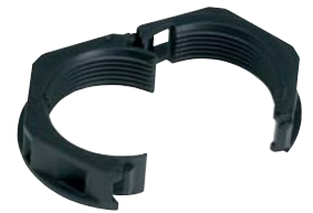
Type GMT: Split locknut