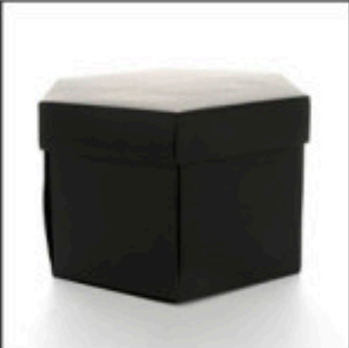
All the results after folding