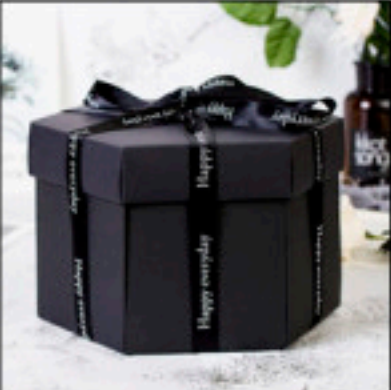
Final renderings, put photos and gifts