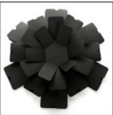
At the bottom of the completion, as shown above