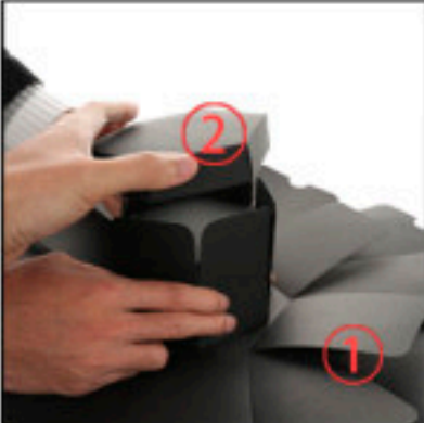
Wrap each layer as shown above and cover it