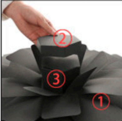
Place the third on the first base and cover the corresponding cover