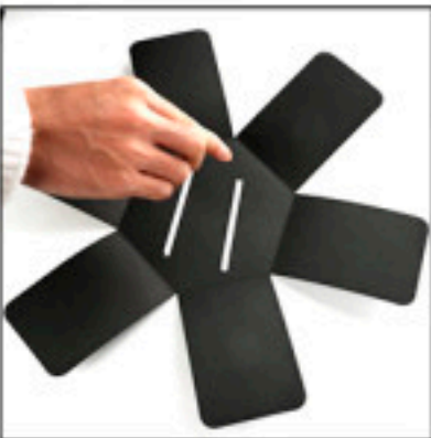
Find the paper as shown in the figure, and attach the double-sided tape to the center.