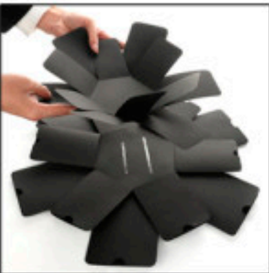
After sticking, fix the bottom with the double-sided tape