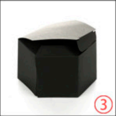
The center box