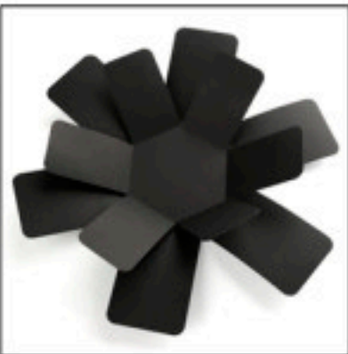
Stick the paper together from big to small as shown above