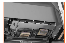
Staggered Dual Print Heads

MUTOH's genuine VerteLith RIP software bundled with FlexiDESIGNER MUTOH Edition 21 optimizes the VJ-1638UR Mark II through these key features: