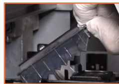
Replaceable Print Wiper