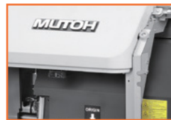
Easy Access Maintenance Panel