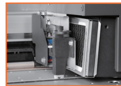
Automatic Media Cutter