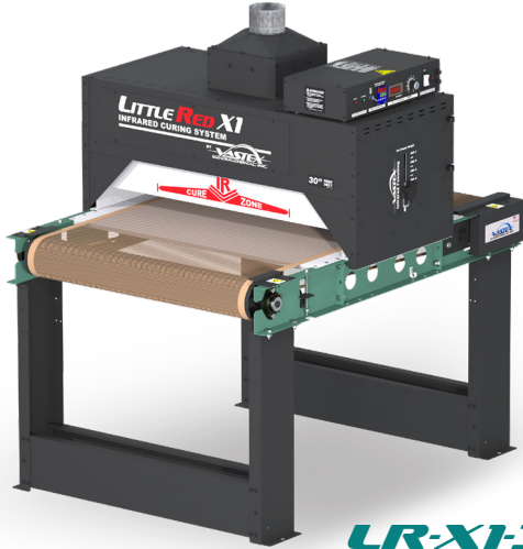
LR-X1-30 120V available

All LittleRed series dryers have a tilting heater design. Works great for curing hats!!