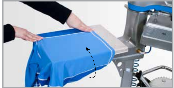
Threadability™ of the lower platen significantly increases your decorating capacity.