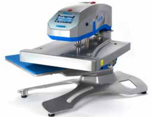
Table Top Air Fusion™

Requires air compressor (not included) with minimum 1/2 horse power and 2 gallon hold tank. Uses 2.3 CFM.