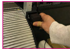
Multi-stage pressure mechanism