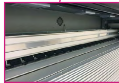
High precision aluminum rail mechanism