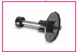
Media Flange for improved handling