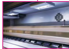
Internal LED Lighting