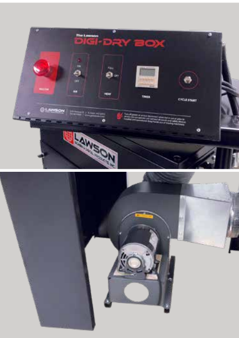
High Output HVAC Blower