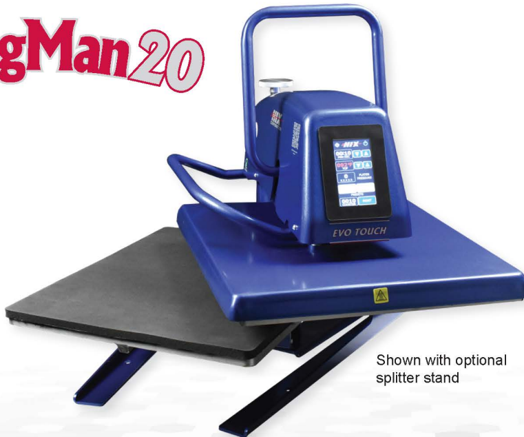
Shown with optional splitter stand