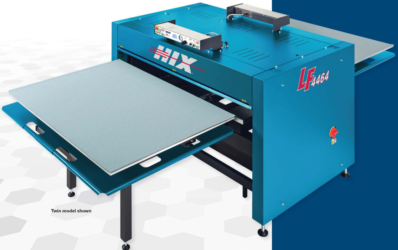
Twin model shown