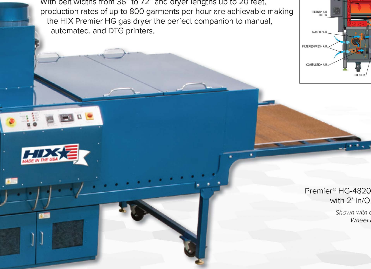
Premier® HG-4820 Graphic Dryer with 2' In/Out Feed