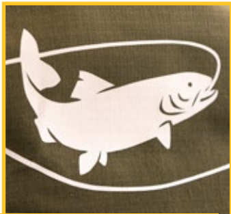
CAD-CUT® Heat Transfer Vinyl