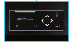
LED touch panel