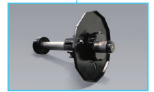
New media feed flange